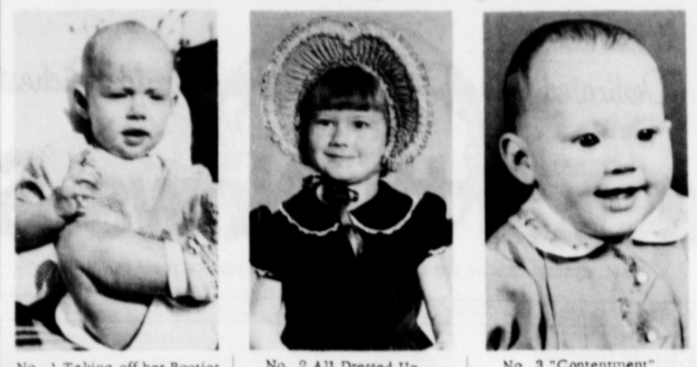
No. 1 Taking off her Booties