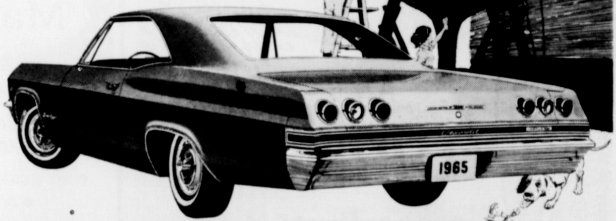
Chevrolet Impala Super Sport Coupe—one of two bucket-seated beauties for '65.

People who buy other big expensive-looking cars get one thing you won't (big expensive-looking payments)