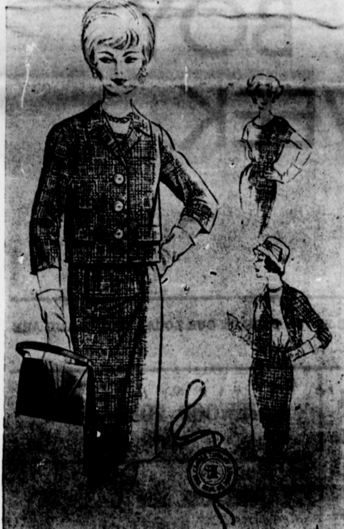
The "Week-ender" TRAVELER