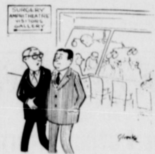
"Now we'll have to invite them over to one of our openings."