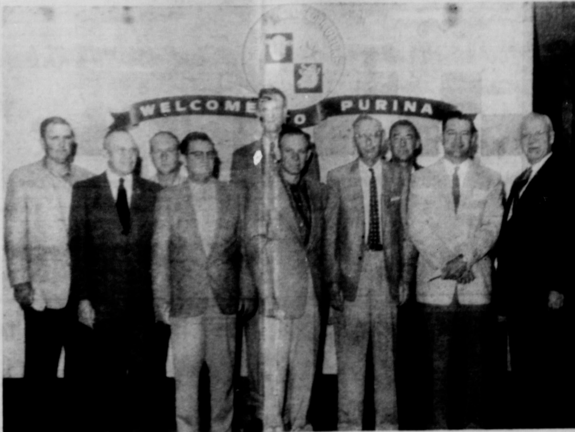
Persons from this area who are pictured above in the Rabson Furina Company offices in St. Louis were among approximate 700 bankers and feed dealers from this section who visited the Purina Research Farm at Gray Summit, Missouri, Monday, April 21 and spent the following day seeing the company's research laboratories and general offices. Thousands of farmers and others interested in agriculture from all sections of the United States and many foreign countries visit the Purina farm each year to see results of experiments