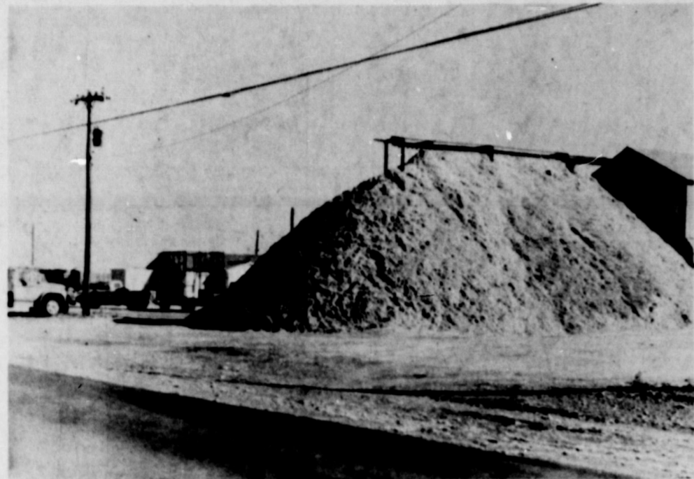
COTTON SEED MOUNTAINS spring up to crowd gin lots in the area as farmers rush trailer after trailer loaded with cotton to the Gins in a big rush to complete the Harvest. This seed mountain is located on the Earth Co-op Gin Lot.