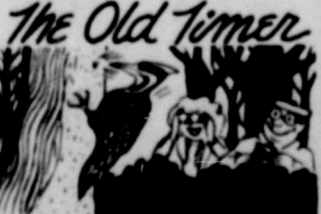
"Even the woodpecker has found that the way to make progress is to use your head."