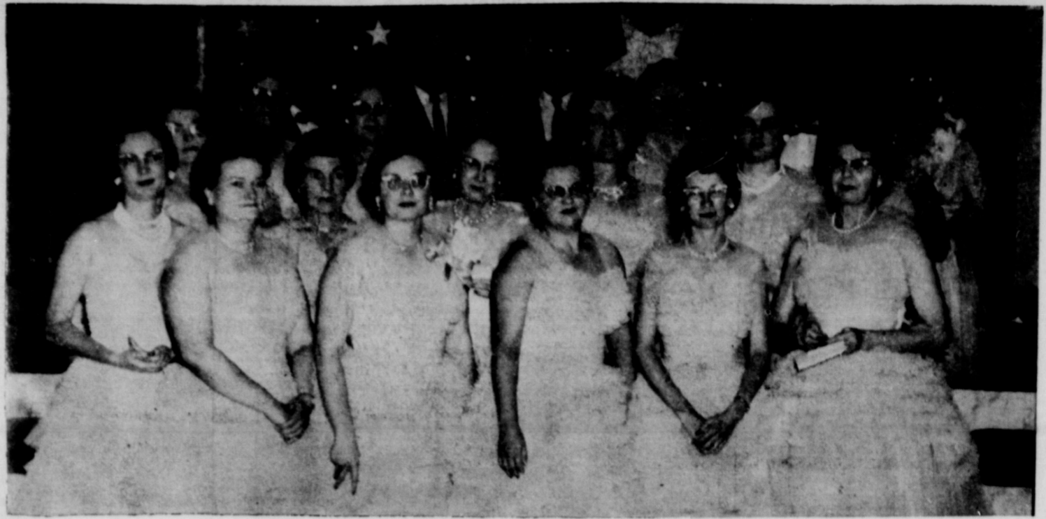
PICTURED ABOVE ARE THE NEW O. E. S. OFFICERS — Installed in an impressive ceremony Saturday night at the Masonic Lodge Hall in Earth. Also pictured are the installing officers and others who were on the program.