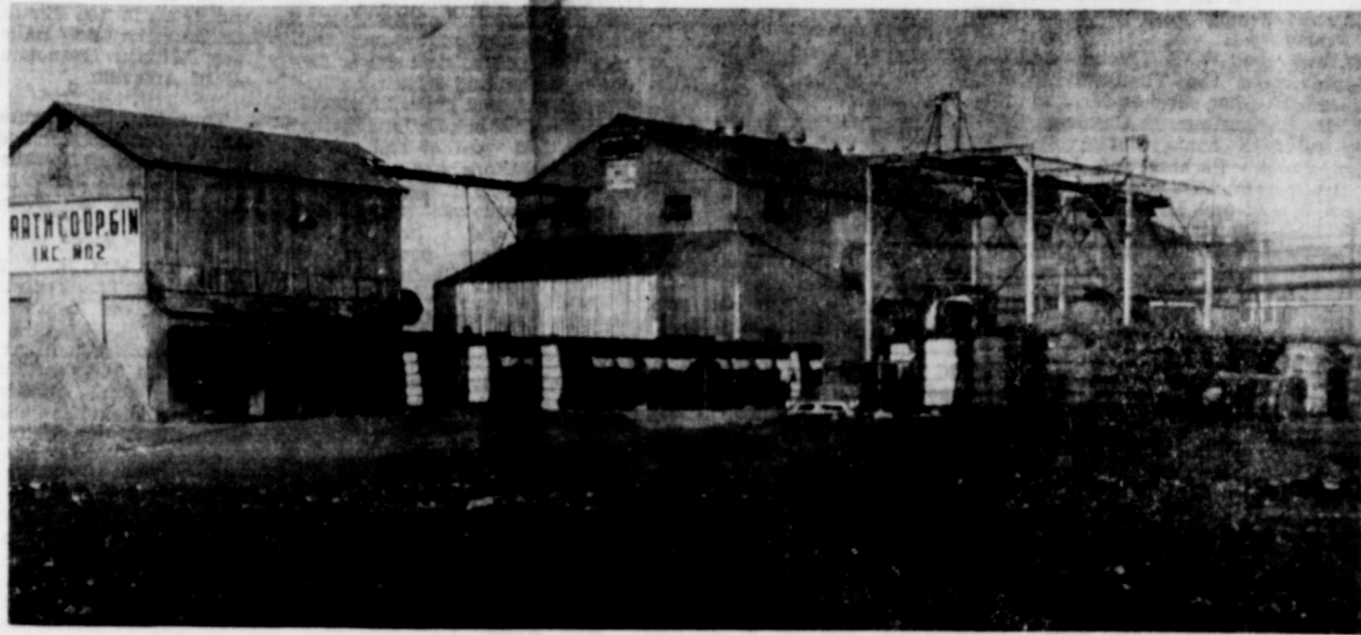
HUNDREDS OF BALES OF COTTON were ginned last weekend following Thanksgiving and a few pretty days. Gins were working around the clock over the weekend, but fog and damp weather