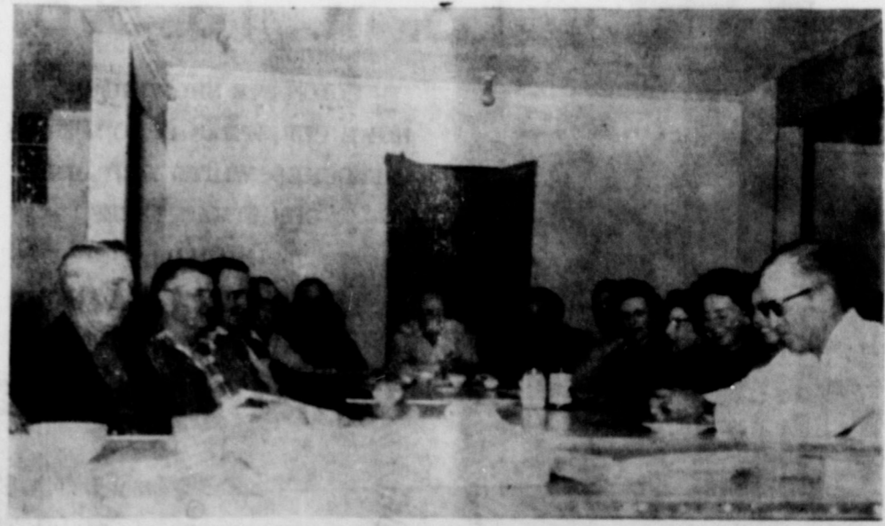
Approximately twenty persons were present Tuesday night, November 21, at the Farmers Union meeting held at the Methodist Church in Earth. The purpose of the meeting was to try to stimulate interest in the Farmers Union program

in the Earth area and to approve a set of resolutions to present to the State Farmers Union Convention in Waco. Delegates were also appointed to the State Convention to be held in Waco December 8 and 9.