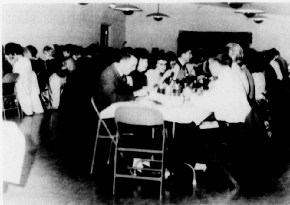
METHODISTS HONOR SENIORS at a noon day luncheon in the church fellowship hall Wednesday. The hall was decorated in the Spanish motif, and a Mexican menu was served.

The 56 seniors, their sponsors, and several Methodist parents attended the luncheon.