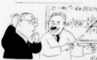
"Nuclear physics is neither new or clear."