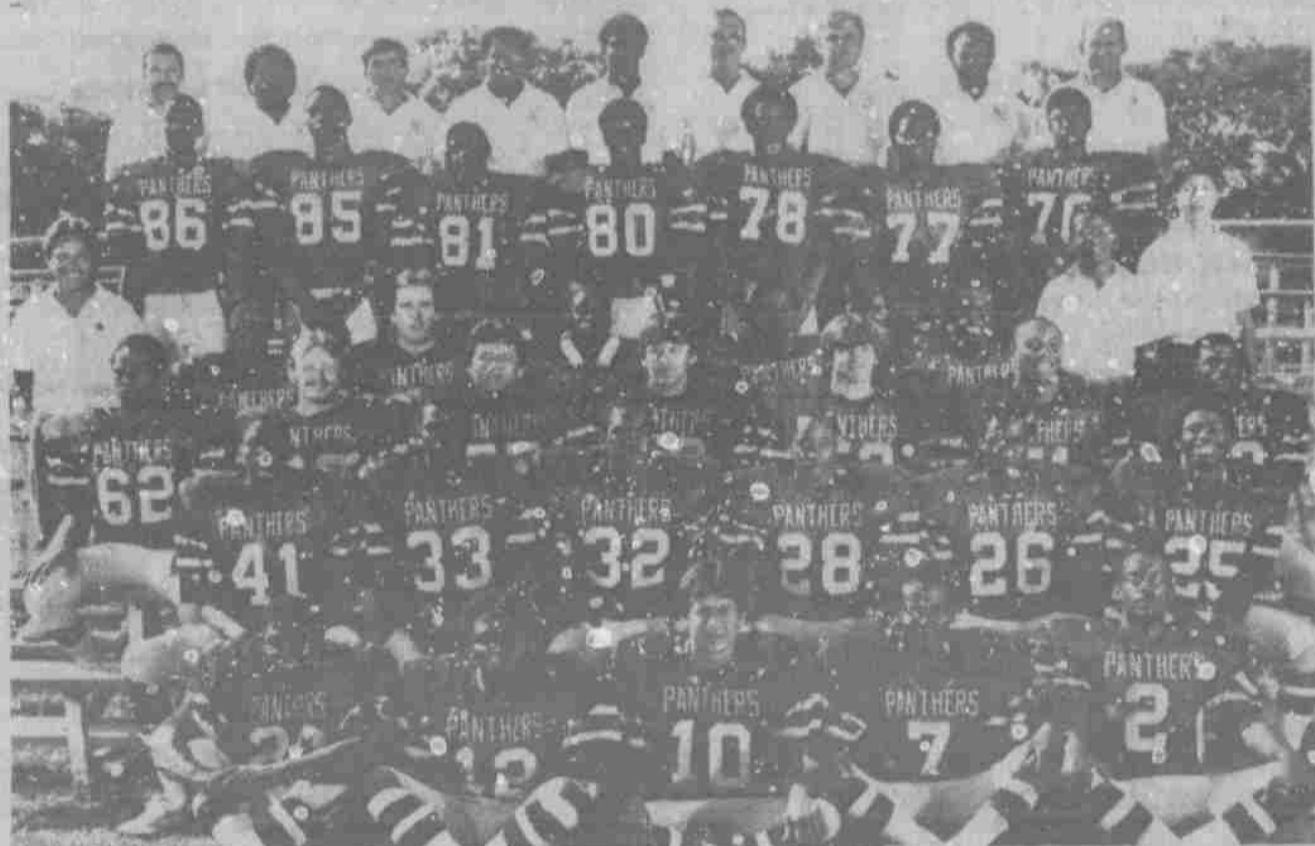
1983 Dunbar-Struggs Panthers