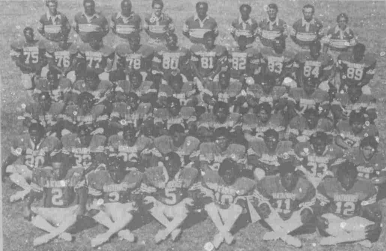
1983 Estacado Matadors