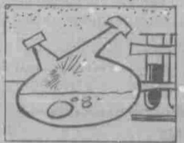
Percy Julian, a black chemist, developed physostigmine, a drug used to treat glaucoma.