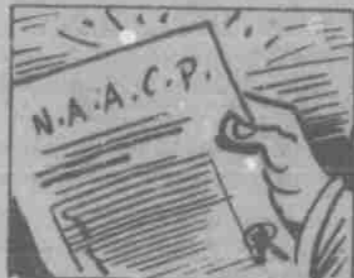
The NAACP was founded in 1909.