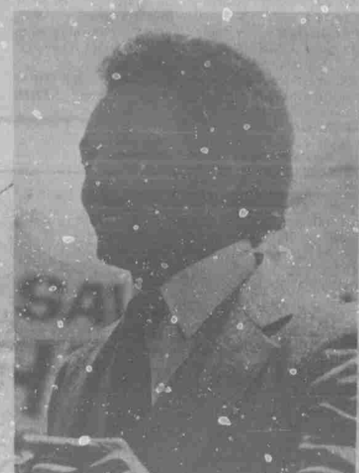
Rev. Jesse Jackson