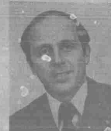
Cong. Kent Hance

Washington - U. S. Rep. Kent Hance, D-Texas, called on President Reagan last week to immediately order a stop to all purchases from the government of Iran. "It is obvious from the evidence we have collected," Hance said, "that terrorists loyal to the Ayatollah Khomeini's government are behind the massacre of American troops in Lebanon."