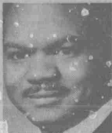
Cong. Walter Fauntroy

While all the facts as to who is responsible for the carnage in Grenada is unclear, it is incumbent upon all people of conscience to condemn violence as a means of