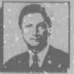
by John Sloan