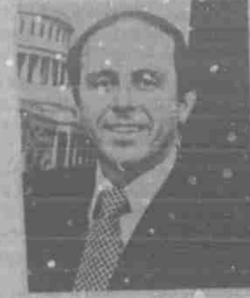
Cong. Kent Hance Hance garnered 456,417 votes (31.26%) to Lloyd Doggett's 453,548 votes (31.06%) and Bob Cruge's 453,375 votes (31.05%).

Regardless of what some may have thought, our friend - Kent Hance, U. S. Congressman, District 19, has electrified the entire state of Texas with his win over two opponents in his bid for U. S. Senate from Texas in the Democratic Primary. Hance, who left the academic arena at Texas Tech University as a professor in the College of Business Administration to the State Senator, District 28th, has been the representative of 19th Congressional District since the retirement of George Mahon. Gearing up for the run-off election, regardless of who he will face in the June 2nd election,