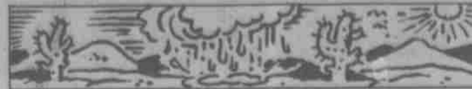
Our driest state is Nevada. Its annual rainfall averages 8.8 inches.