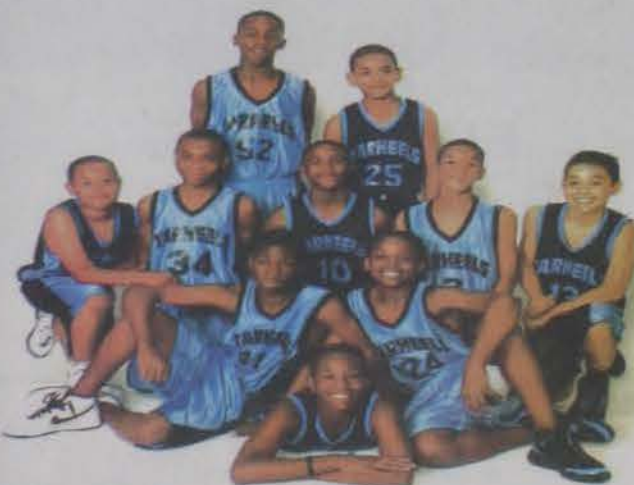
2009 Lubbock TarHeels Basketball Team

The Lubbock TarHeels have qualified to compete in the National AAU Tournament which will be held in Hampton, Virginia, July 2 thru 5, 2009. They will compete in the 12 and under 6th grade division as they represent Lubbock and West Texas in their quest for a national championship title. These