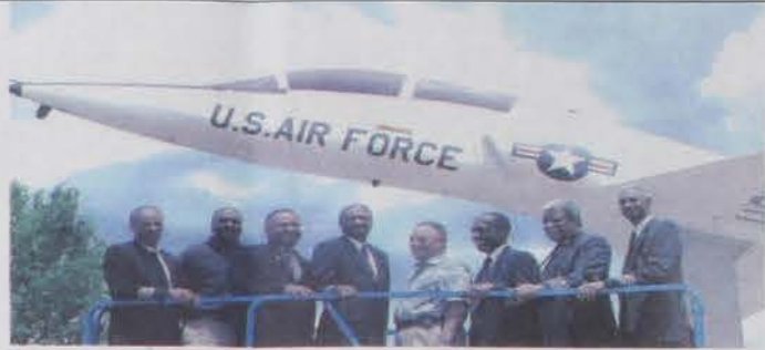
Pictured above are Black Pilots who were in attendance at a 30th year Reunion held at the Science Spectrum last weekend, May 29 & 30, 2009. They re-visited Lubbock for the first time in more than 30 years. At one time, there were no Black Pilots at Reese, but this group recognized and remembered.