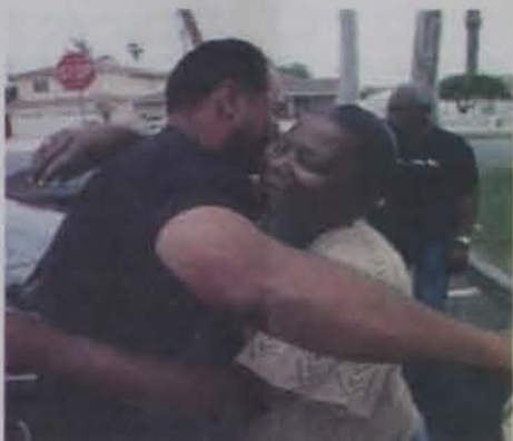
Federal authorities call the case against the Varrio Hawaiian Gardens gang, accused of systematically trying to purge black residents from the predominantly Latino city in south Los Angeles County, the most egregious example of racially motivated gang crime in years.

"If you do a survey within the African-American community ... you are in constant fear that your young male offspring is