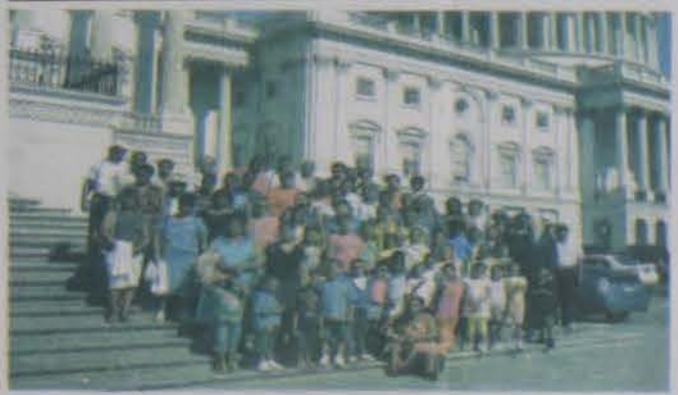
Greater St. Luke Missionary Baptist Church of Lubbock, Texas tours Washington, D. C. and takes photos on the steps of the U. S. Capitol Building June 24, 2009 with Congressman Randy Neugebauer.

Thompson Lincoln/Douglass Committee want to thank their supporters and donors. If it had not been for their generosity and kindness, these scholarships would not have been possible. Your help is appreciated.