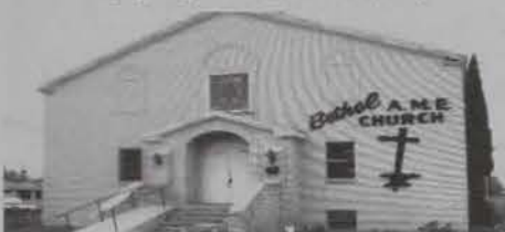
The members of Bethel African Methodist Episcopal Church, 2202 Southeast Drive, will be celebrating their Eighty-Eighth Church Anniversary on Sunday afternoon, May 3, 2009, at 3:30 p.m. The theme is "Growing By

Bethel African Methodist Episcopal Church Celebrates Eighty-Eighth Church Anniversary