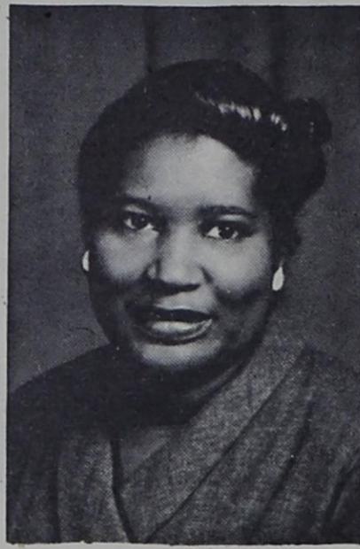
talented young people who may be interested in a Continued on Page 4

The course is designed to strengthen the quality of high school journalism courses, to improve scholastic newspapers and to provide teachers with information which will be helpful to them in advising