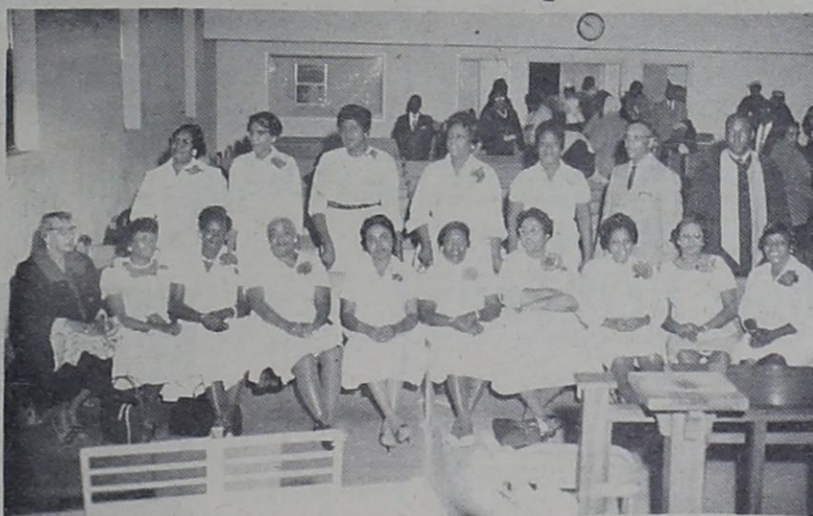
Lottie Circle of Mt. Gilead Baptist