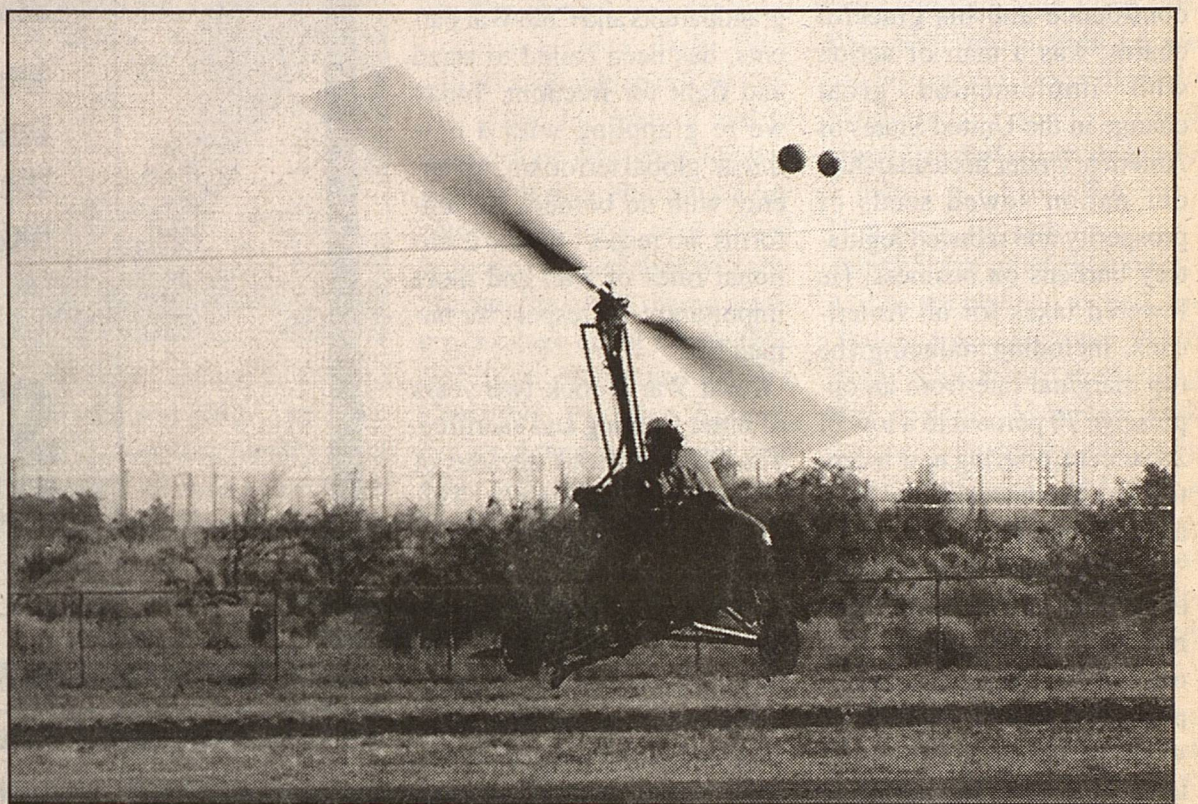
Neal Newsom arrived from Plains in his Gyro-copter... if that's the correct terminology

Early morning fog delayed the annual Fly-In at Denver City last Saturday morning. As the crowd gathered at the main hangar, a number of aircraft could be heard overhead, but it was impossible for them to see the runway in the surprise fog. It was almost 9 AM before the first aircraft was able to touch down. Officials later reported about 28 aircraft visited the airport for a great breakfast prepared by hard working volunteers, and to fill their planes with bargain price aviation fuel.