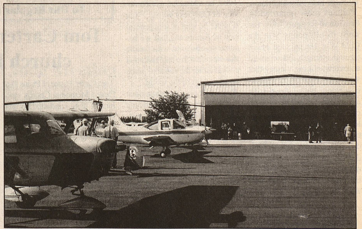
Aircraft began parking near the hangar where a free breakfast awaited