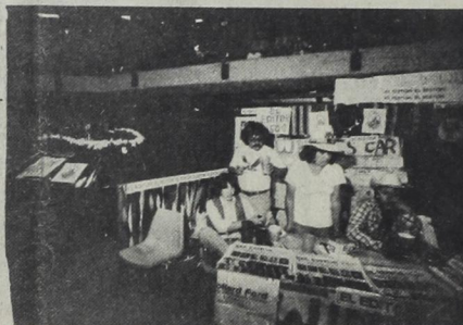
Durante las fiestas mas de 10,000 personas se registraron para ganarse el carro dado por El Editor y patrocinadores. En esta foto los trabajadores de el Editor en el puesto durante las fiestas del 16.