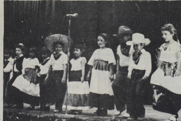
Niños de las escuelas primarias de Lubbock tambien participaron con su talento; unos bailaron, otros recitaron y tambien estuvieron modelando vestuario del folklor mexicano. Estos grupos fueron dirigidos primordialmente las maestras bilingues, del Distrito escolar de Lubbock.