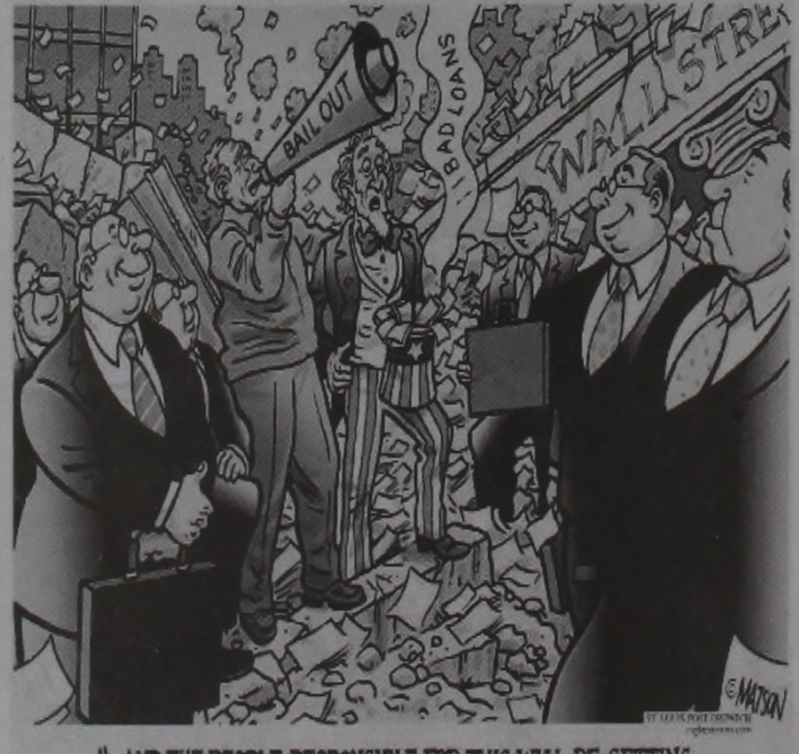
... AND THE PEOPLE RESPONSIBLE FOR THIS WILL BE GETTING BIG FAT CHECKS FROM ALL OF US SOON!!

Email: eleditor@sbcglobal.net or acruzts@aol.com