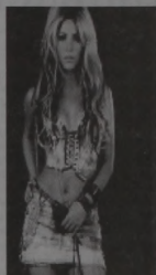
made $420 million dollars from concerts and album sales last year. As for Shakira, they took into account her 98 concerts and her earnings from the song "La despedida," which was featured in the film Love in the Time of Cholera.

The publication calculated that together, the 20 list-toppers