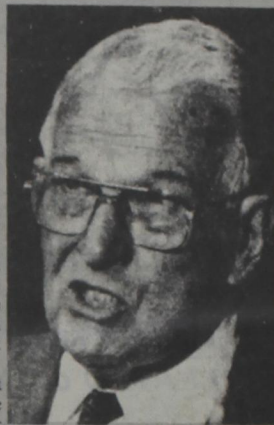
Gov. Bill Clements

In a related local development, the assitant superintendent of the Lubbock Independent School District (LISD) said LISD's statistics on the 1986-87 dropout rate in LISD should be available this coming week.