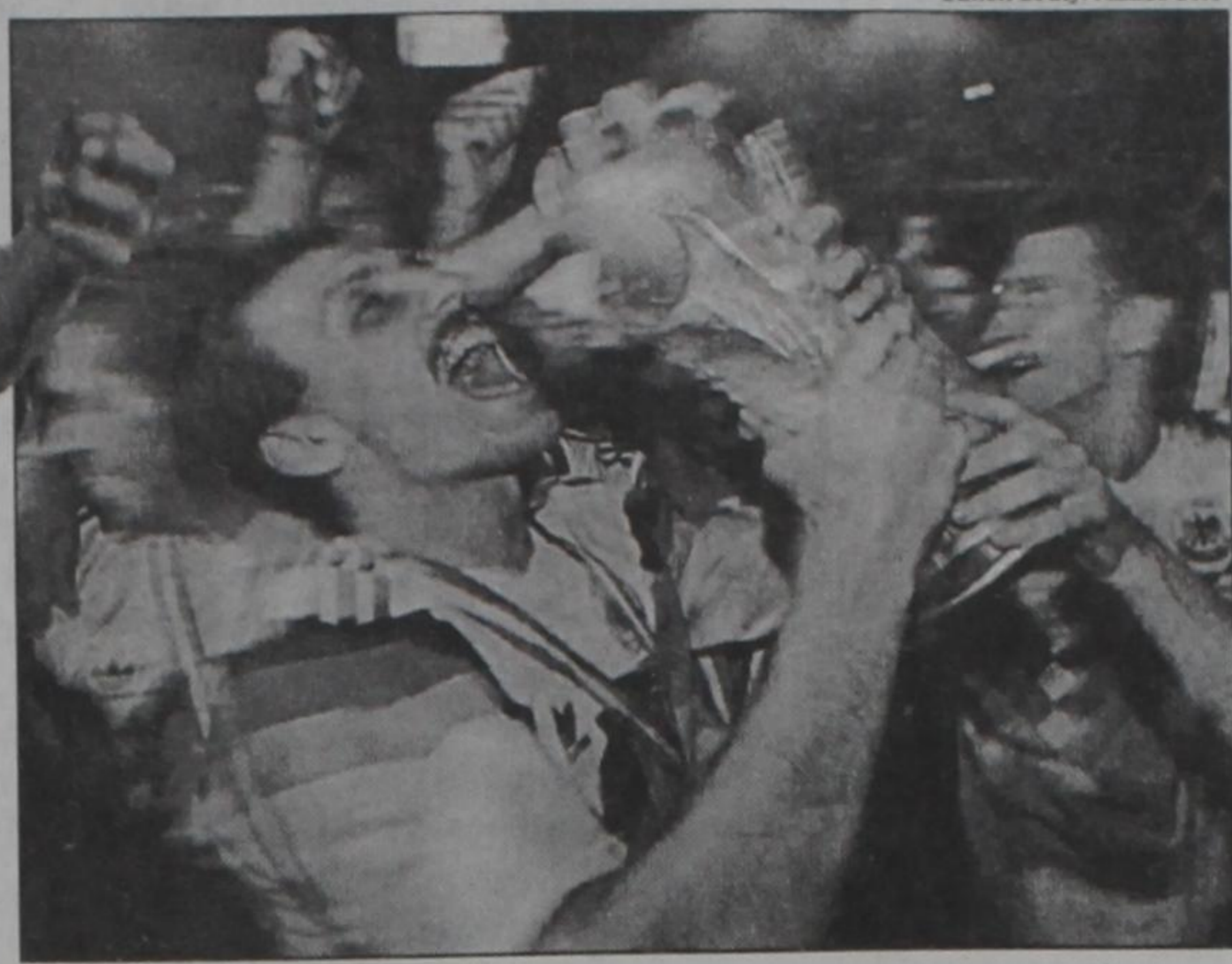
Will Germany celebrate another World Cup win in 1994?