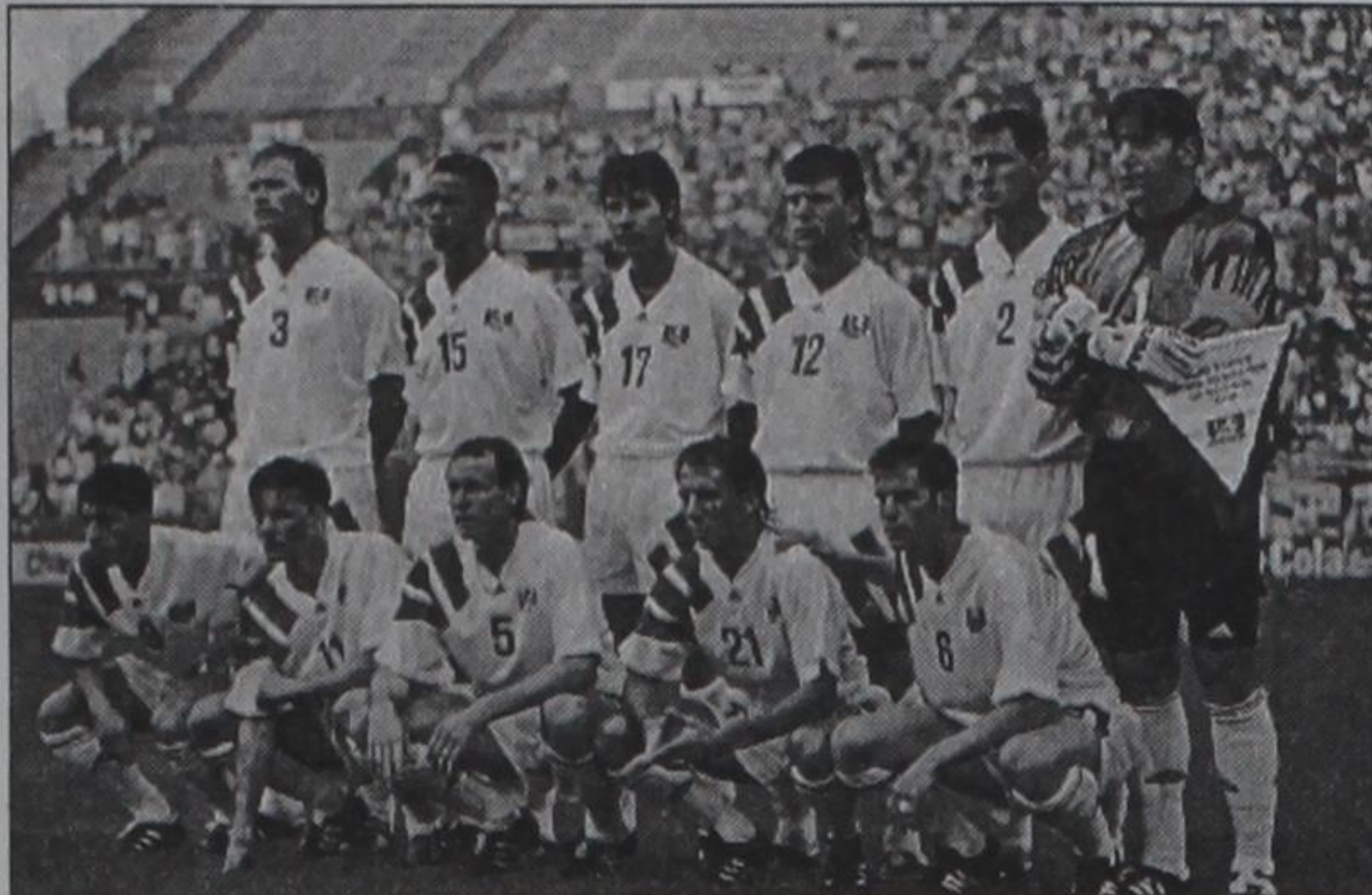
The U.S. team could be a soccer surprise on its home turf.