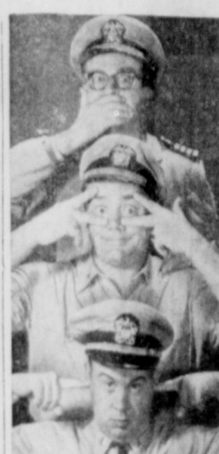
McHALE COMING — Joe Flynn, Ernest Borgnine and Tim Conway, just part of the crew from "McHale's Navy", will be seen Sunday and Monday at the Caprock Theatre in Slaton. It's the first full-length motion picture in color for McHale's crew.

WAN, ED: The Slatonite would like to start running news from the rural communities. We are looking for a correspondent for Wilson, Union, Posey and Roosevelt. If interested in a part time job of gathering news, contact THE SLATONITE on Thursday or Friday. Phone VA 8-4201. 48 tlc