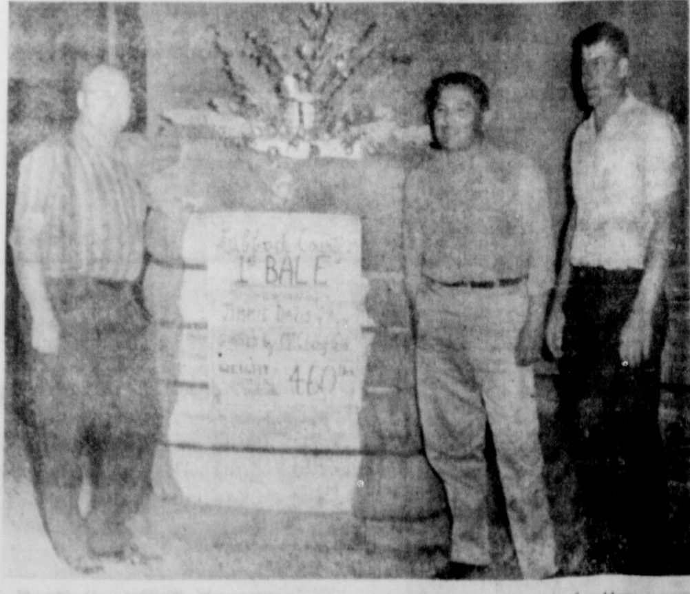
COTTON AWARD WINNERS — These three Slaton area farmers were recipients of cotton awards at the 7th annual Farmer-Merchant Barbecue Tuesday night. They received $150, $100 and $50 cash prizes for