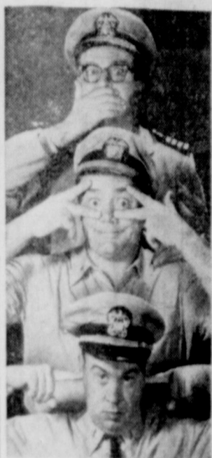
McHALE COMING - Joe Flynn, Ernest Borgnine and Tim Conway, just part of the crew from "McHale's Navy", will be seen Sunday and Monday at the Caprock Theatre in Slaton. It's the first full-length motion picture in color for McHale's crew.

WANTED: The Slatonite would like to start running news from the rural communities. We are looking for a correspondent for Wilson, Union, Posey and Roosevelt. If interested in a part time job of gathering news, contact THE SLATONITE on Thursday or Friday. Phone VA 8-4201. 48 tfe