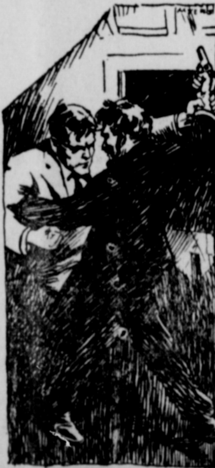
But His Gun Was Out. As He Raised It Rainey Gripped With Him.

His snarl had changed to a smile, and he seemed to have swiftly controlled himself. The girl looked at both of them and slowly went into the