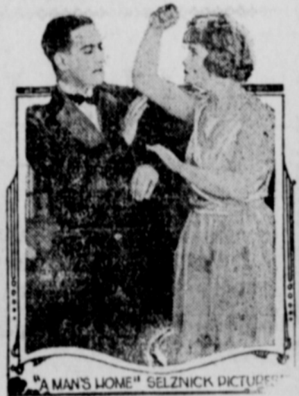
"A MAN'S HOME" SELZNICK PICTURES At the Wilselma Theatre two days, Feb. 28th and March 1st.