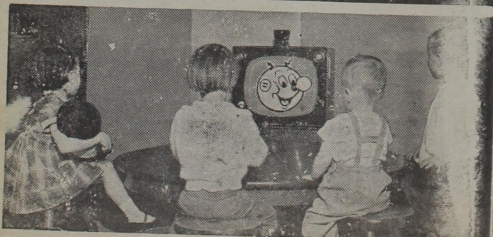
Deesé, 5; Kelly, 4; Todd, 1½ and Paul, 7, enjoy television on stools especially for them. All of the children's clothes sparkle even though they've been