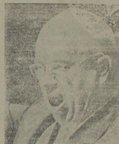
This man has plans for your future too, but you wouldn't like them. An important way we can keep our ambitions in check is to keep strong financially—as individuals and as a Nation.

There probably isn't a better way to put your savings to work, to help build freedom for your future. Why not start today at your bank... or on The Payroll Savings where you work.