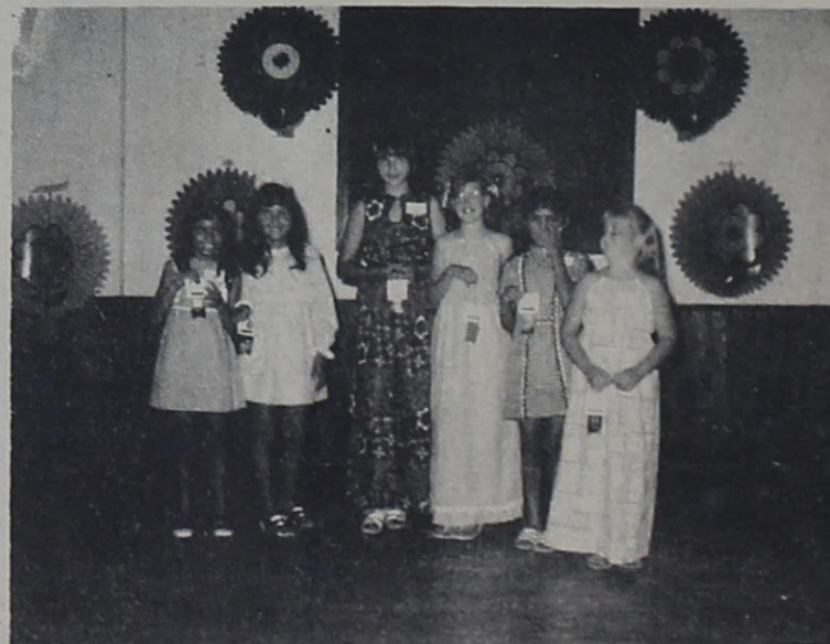
ROPES 4-H ENTRANTS