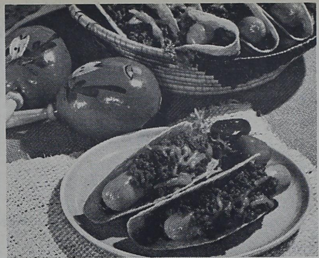
"TACO DOGS," the popular frankfurter in south-of-the-border dress, will keep family interest in hot dogs hot.

But who should we care about, who should we help? This is the easiest of all questions to answer. We are all in this same boat—this wordly existence, and life is stormy and turbulent for so many of us. No, we don't have to look far, many times not even out of our own homes, to find the answer to who is in need. God can be our anchor and our joy for life itself.