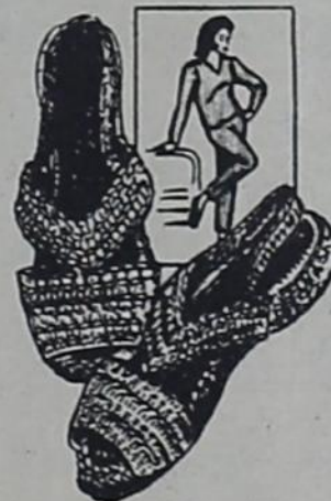
1153 CROCHETED SLIPPERS

If you want to look feminine and frivolous, add the ruffle trim to this jumpsuit—it's optional. No. 3413 comes in sizes 10 to 18. Size 12 (bust 34) takes 2¼ yards of 44-inch fabric.