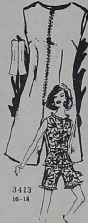
3413 10-18 Frilly or Tailored

If you want to look feminine and frivolous, add the ruffle trim to this jumpsuit—it's optional. No. 3413 comes in sizes 10 to 18. Size 12 (bust 34) takes 2¼ yards of 44-inch fabric.