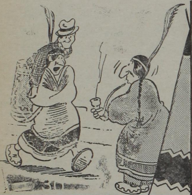
"IT'S ALL RIGHT, I'M GIVING A HITCH-HIKER A LIFT TO DES MOINES!"

Read The Ads Save Money By Trading At Home