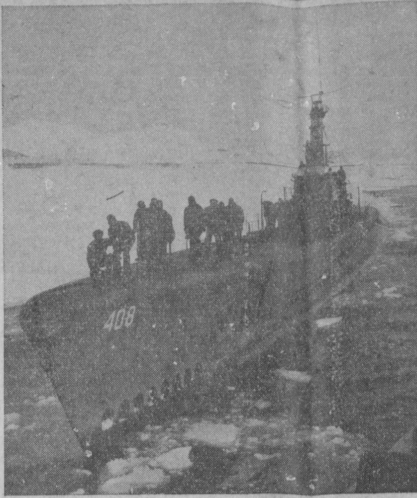
The far-flung activities of American submarines during World War II that brought the undersea craft to the home waters of the Japanese Empire in the van of the fighting fronts, are continued into peacetime as the submarines, like the USS Sennet (above), penetrate the Arctic and Antarctic. Submarines are important units of the Navy's postwar expeditions and projects probing the mysteries of distant oceans for scientific data to be used for future planning.