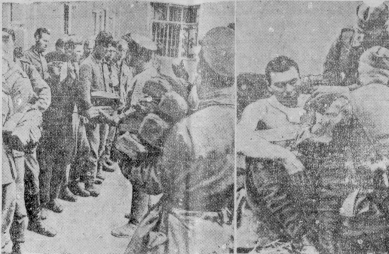
Picture at left shows captured Nazis receiving bread from Russian soldiers, according to the Moscow and London censor-approved caption. In the picture at the right German troopers are giving first aid to a wounded Russian soldier. It would seem that both sides in this terrific conflict like to send out photos showing their men rendering aid to wounded enemies.