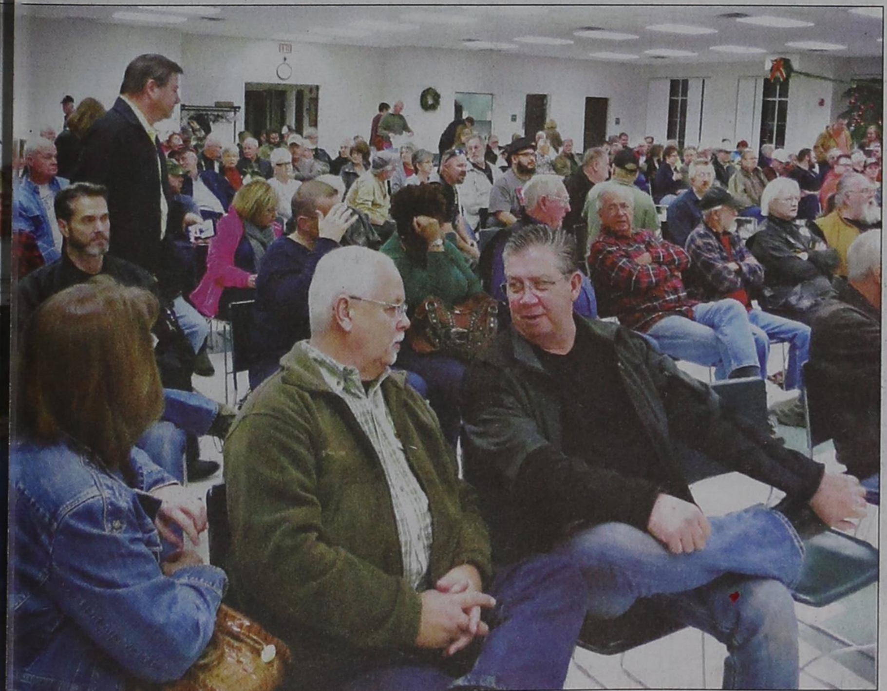
More than 200 people packed the house at The Center at 108 East Washington at 6 p.m. Saturday for a briefing session on the new Open Carry Laws that will go into effect on Jan. 1.

Holy Trinity plans Christmas activities The Holy Trinity by the Lake Episcopal Church has planned several special Christmas services. On Thursday Dec. 24, a Holy Eucharist with children's pageant will be hosted at 5 p.m., followed by an 8 p.m. Holy Eucharist and a 10:30 p.m. choral candlelight Eucharist (with incense). There will be no Christmas day service.