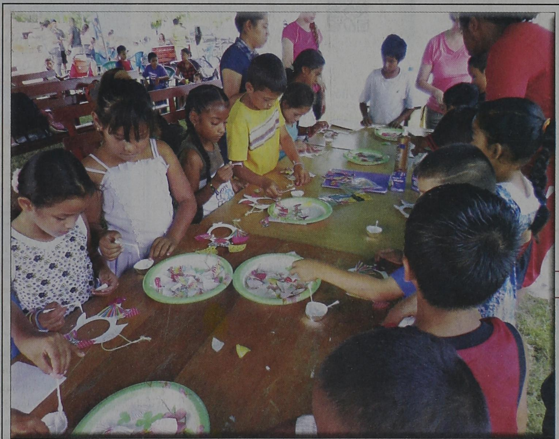
The youth mission team from First Christian Church Rockwall recently conducted a vacation Bible school in San Lazaro, Belize. Pictured above are some of the children who attended the Bible school classes and enjoyed a crafts project.