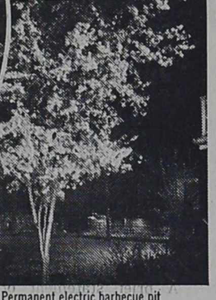
Permanent electric barbecue pit and lighted back yard