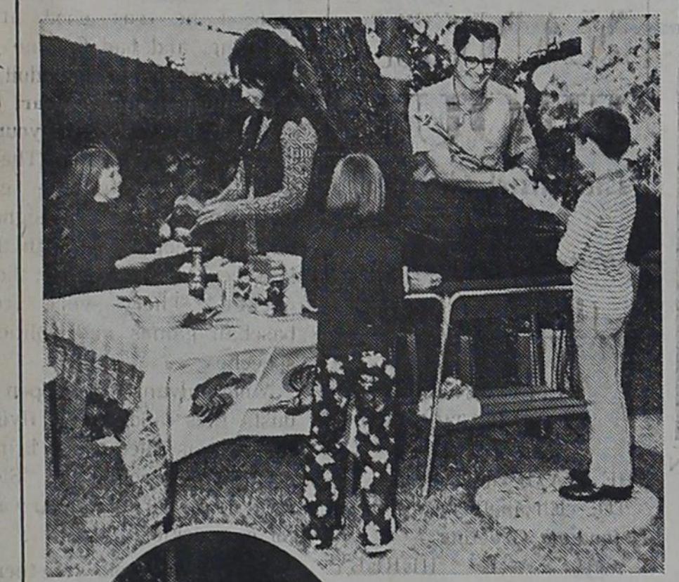
Portable electric grill