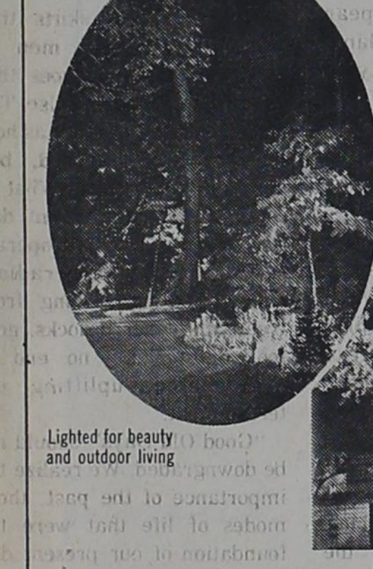
Lighted for beauty and outdoor living