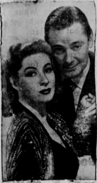
Joan Crawford and Herbert Marshall, star of "When Ladies Meet."