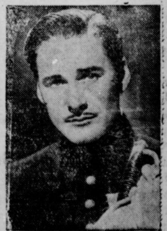
ERROL FLYNN — Hero of so many thrilling screen adventures tops them all with the thrills of his newest, "Santa Fe Trail" at the Rialto Theatre, Brownfield.