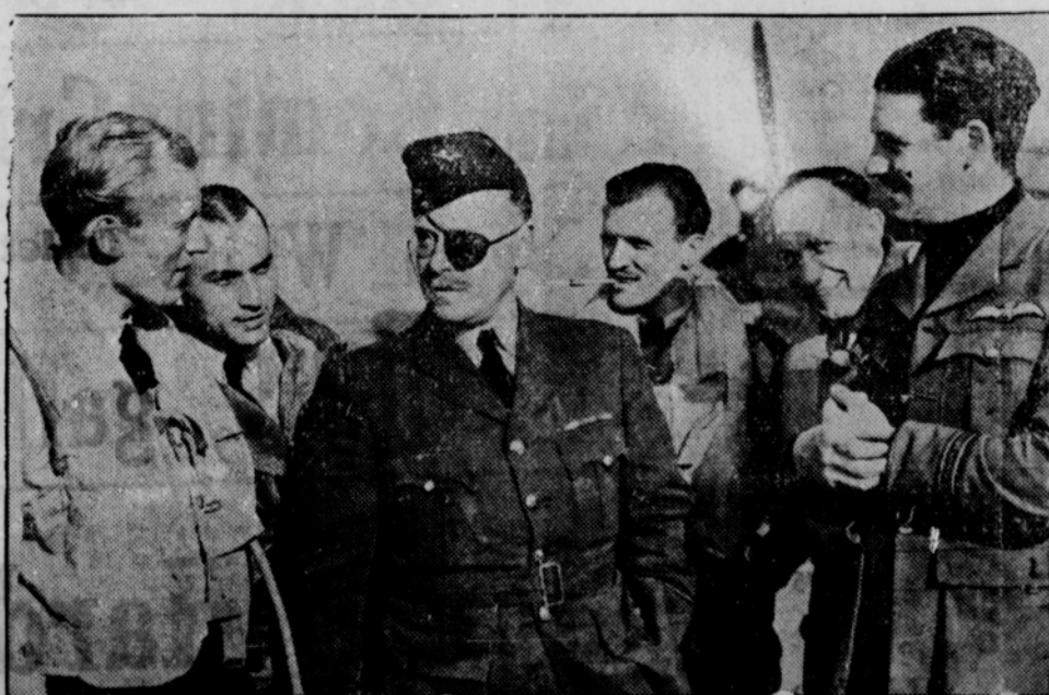
Among the Royal Air Force's most fearless, versatile flying fighters, the Czechoslovak Squadron has downed more than 250 planes. Fighting indomitably on from one country to another—their own, Poland, the Low Countries, France—they now make their final stand on the British Front. A favorite character in the Squadron is the Adjutant (above), a war-scarred veteran admired by British and Czechoslovak fliers alike.