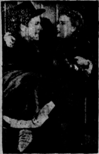
Donald Douglas and Martha Scott in "Cheers For Miss Bishop."

Funeral services and burial were held in Meadow Saturday afternoon, with the Plains Funeral Home in charge.