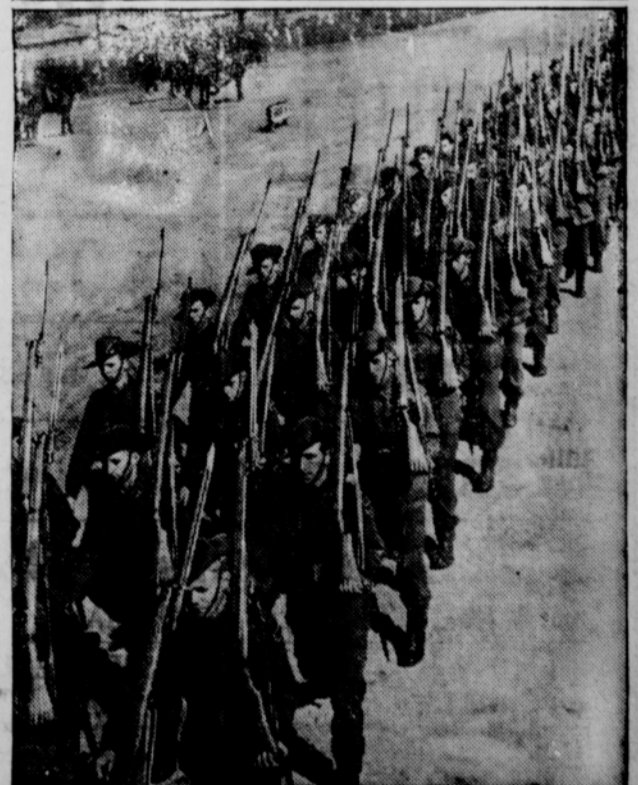
Outstanding in the Allied struggle for freedom are the Australians, fierce and romantic fighters, shown here in review as they embarked for Libya, where they played an important part in striking victories. The "Aussies", military communiques have disclosed, are virtually irresistible in battle, while their happy-go-lucky spirit has won them friends the world over. They fight side by side with the armies of Belgium, Czechoslovakia, the Free French, Luxemburg, the Netherlands, Norway, Poland and the sister nations of the British Commonwealth.