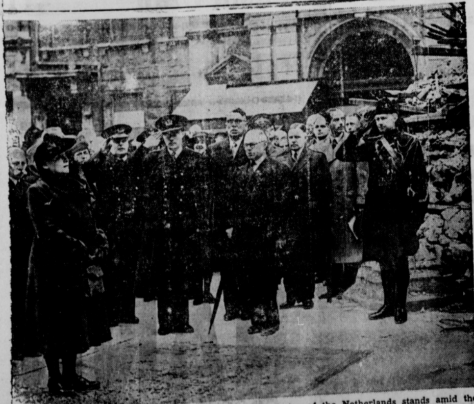
Breastfast in the faith of her forefathers, Queen Wilhelmina of the Netherlands stands amid the war-shattered ruins of the Dutch Church where Hollanders in London have worshipped for centuries. Mainly on religious grounds, the Queen's government has never recognized the Soviets, yet she recently took her place beside the other Allies in welcoming Russia as a fellow-fighter against the one great menace—Nazi Germany. With her is her son-in-law, Prince Bernhard, himself a German by birth, who has just been visiting the United States and telling Americans of the part Holland is playing in the Allied struggle for freedom.