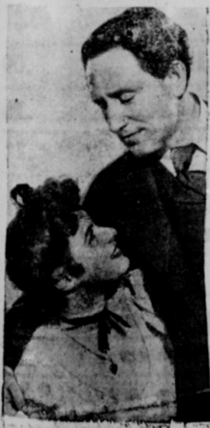
Spencer Tracy and Ingrid Bergman in a scene from "Dr. Jekyll and Mr. Hyde," currently playing at the Rialto Theatre. Tracy plays the dual title roles of the Stevenson story, with Miss Bergman cast as Ivy, the barroom singer who is the victim of Mr. Hyde's sadistic affections.