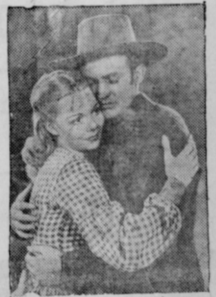
Jane Wyman and Arthur Kennedy carry the romantic interest in "Bad Men of Missouri."