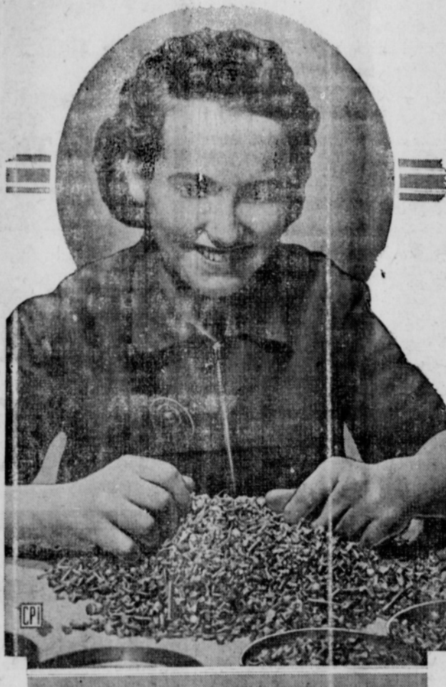
Passed by censor THIS young woman who was a cashier when war broke out is one of the many thousands of women who are doing a great job in Canadian war industry. She is employed in an aircraft factory where her accurate eyes and nimble fingers deftly sort the rivets that have been dropped by the men who put the aircraft together. Even in a country as rich in minerals as Canada, metals are vitally important these days and not a scrap is wasted.