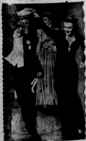
Deanna Durbin and Charles Laughton, co stars of Universal's "It Started With Eve," exhibit the conga in this unusual romantic comedy drama.

Young men of the above class interested in enlisting in the Air Corps or other branches of the Regular Army are urged to contact the recruiting office at once as they can not be accepted for enlistment after they have passed through the examining Station, but must wait until they are called for induction.