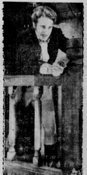
Gene Raymond as Jeromy Wayne, the crazed suitor whose shot results in the tragic death of Mooneyan, played by Jeanette MacDonald in MGM's technicolor version of "Smilin' Thru." The picture marks the first appearance of Raymond with his wife, Miss MacDonald. Brian Aherne costars.

The latest report issued is to the effect that most of the cases are not too severe.