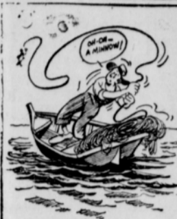
FISHING LINES NEARLY A MILE LONG ARE USED BY FISHERMEN OF MADEIRA, PORTUGAL TO CATCH "ESPADAS" THAT SWIM 4,000 FEET BELOW