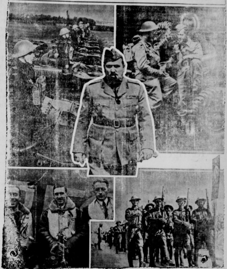
Poland's part in Democracy's battle for freedom and a new world order is an important one—both in morale and men. Beside the armed forces of the other Allies—Belgium, Czechoslovakia, the Free French, Greece, the Netherlands, Norway and the Nations of the British Commonwealth—the Polish forces fight doggedly on with a singleness of purpose, the destruction of Nazism and its attempt at world domination. Above, typical of the fighting men of Poland ready in England, is a Polish general, while at the upper left is shown a light armored division of the Polish forces in England. A British "Tommy" chats in characteristic companionship with a Polish artilleryman (upper right) while the photos below show the Polish crew of an R.A.F. bomber and a company of Polish infantry, which has been fighting valiantly in Libya.