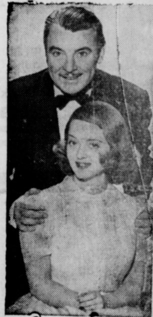
Davis and Brent, Stars of "The Great Lie."