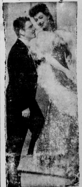
Robert Preston and Loreta Young in one of the romantic sequences of Frank Lloyd's "The Lady from Cheyenne."