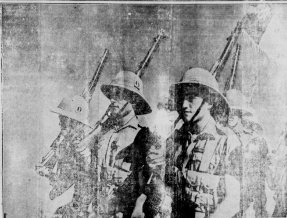
Free French Forces have joined the other fighting units of the Allies—Australians, Belgians, Czechoslovaks, Luxemburgers, Dutch, Norwegians and Poles—in action against Nazi invading forces, particularly in the various contested sectors of Libya and Syria. Above, a contingent of French Colonial infantry, part of the De Gaulle forces which repudiated the Franco-German armistice, are shown again on the march, probably "somewhere in Syria" with the Free French tri-color banner flying proudly.