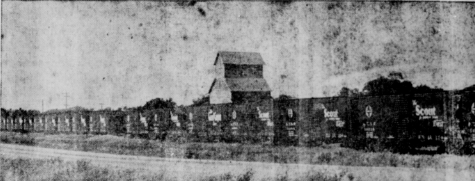
These new Santa Fe Railway box cars stored at a country elevator indicate the preparation being made to handle the bumper 1941 wheat crop. The scene is typical throughout the southwest. Storage facilities for the new crop remain a big problem. Terminal elevators remain from 60 to 80 per cent filled with old wheat while a crop of 554,120,000 bushels is expected this summer.

Art Names has secured the famous picture HIGH SCHOOL GIRL for use on his show this season and will show it during his stay in Meadow next week - those who have seen this remarkable picture are very enthusiastic about it. The admission on the night HIGH SCHOOL GIRL is played will be children 10c and adults 20c. Plan on seeing this great picture.