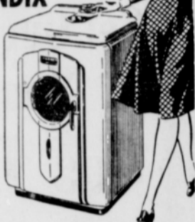
BENDIX Automatic HOME LAUNDRY

Automatically WASHED • RINSED • DAMP-DRIED Put your clothes in, set a dial and take them out—ready for the line! That's all there is to "washday" with a Bendix in the home. Your hands need never touch water—and clothes are clean and sanitary. Rid yourself of "washday"! You can buy a Bendix for the price of a good ordinary washing machine!