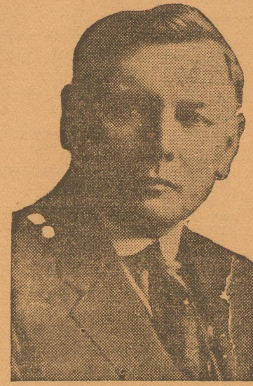
GOV. R. S. STERLING