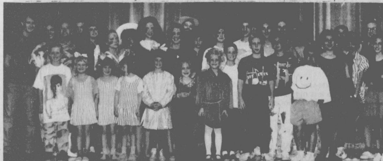
Participants in the "Read My Lips" lip sync contest gather on the Gruver school stage before the contest begins.