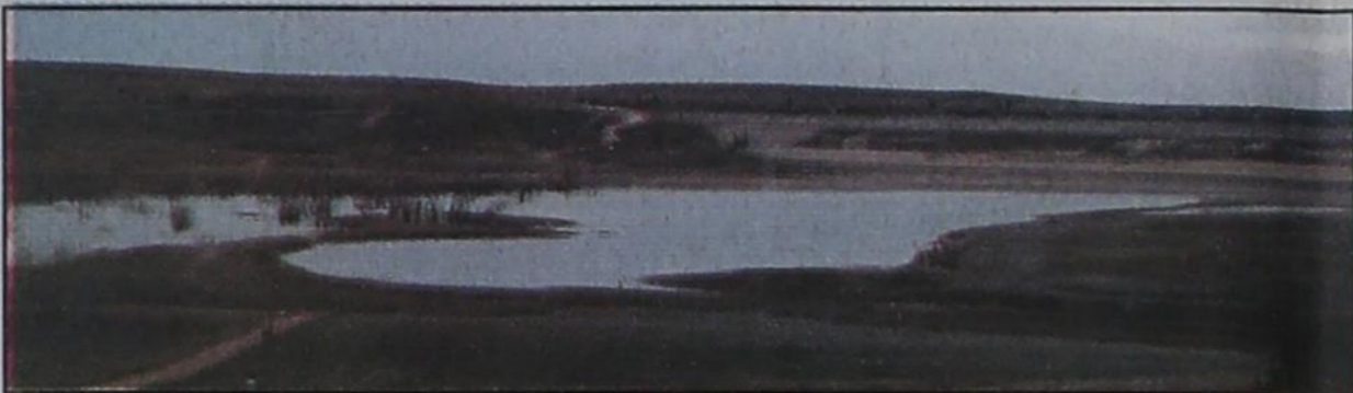
Lake Palo Duro on Tuesday, March 27, 2010 at new low of 15.43 feet.