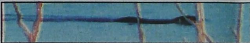
Beaver swimming at Lake Palo Duro on March 22, 2010.

Lake Level--March 29, 2010--15.43 feet (-0.06)