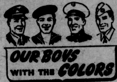
OUR BOYS WITH THE COLORS