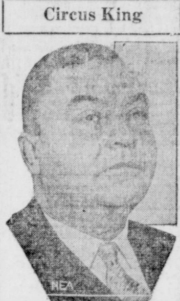
John Ringling, above, is truly the king of the sawdust rings. Already owner of Ringling Brothers, Barnum & Bailey, and the Forepaugh-Sells circus, he recently purchased five more circuses—Sells-Floto, Hagenbeck-Wallace Animal Show, Sparks, John Robinson and Al G. Barnes Wild Animal Show. The purchase price was not named, but the deals followed failure of Ringling to reach an agreement with Madison Square Garden for performance dates in New York.

The keenest collectors of autographs are now said to be concentrating on obtaining the autographs of autograph hunters who have obtained the most prominent autographs—Troy Times.